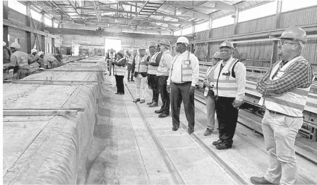
Colossal Concrete Products management and guests in the recently reopened De Aar precast concrete manufacturing plant.